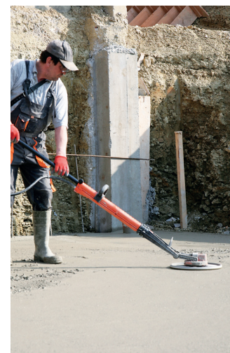
Levelling fresh concrete