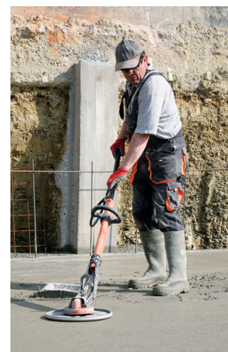
Spine friendly working