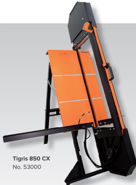
Tigris 850 CX No. 53000