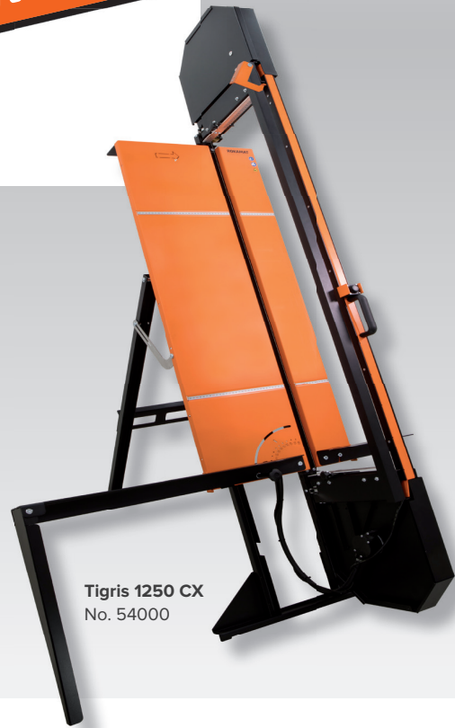
Tigris 1250 CX No. 54000