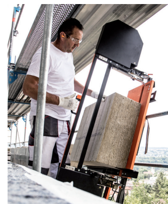
Tigris 850 CX – perfect for working on scaffolding