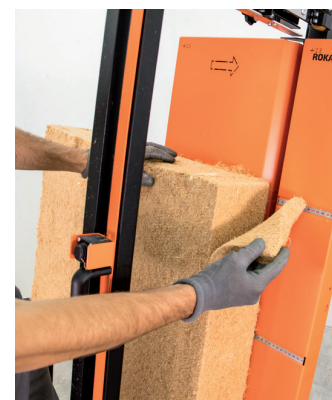
Also suitable for wood fibre insulation boards (special accessories)